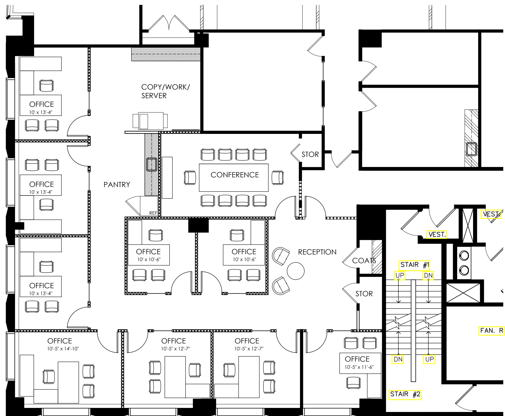
1 SCHEMATIC PLAN SK SCALE: 1/8" = 1'-0"